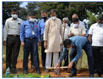
Ground breaking by DC