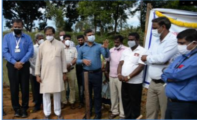
Address by the DC