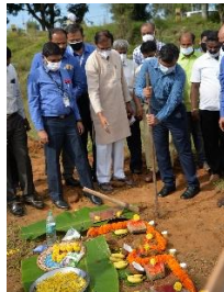
Ground breaking by DC