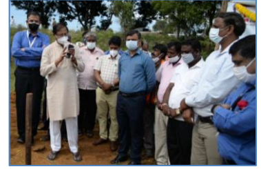
Thanks speech by Village representative