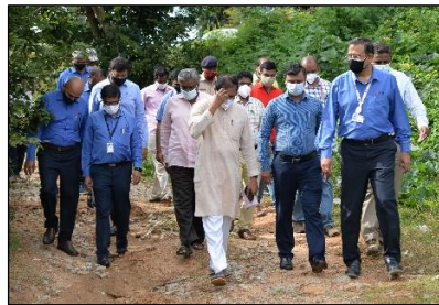
Guests arriving at the venue