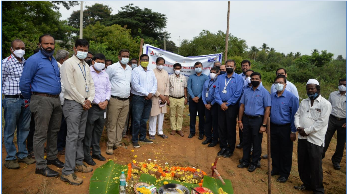
IMEC and UWBe team with the DC and Village representatives